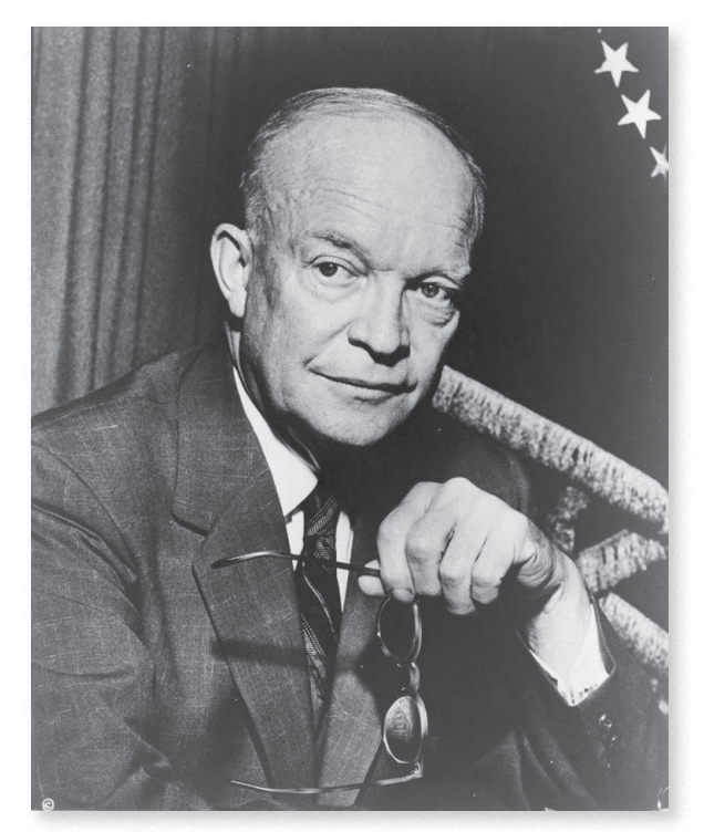
President Dwight D. Eisenhower

NAACP: the National Association for the Advancement of Colored People founded in 1909. Its mission is "to ensure the political, educational, social, and economic equality of rights of all persons, and to eliminate racial hatred and racial discrimination."